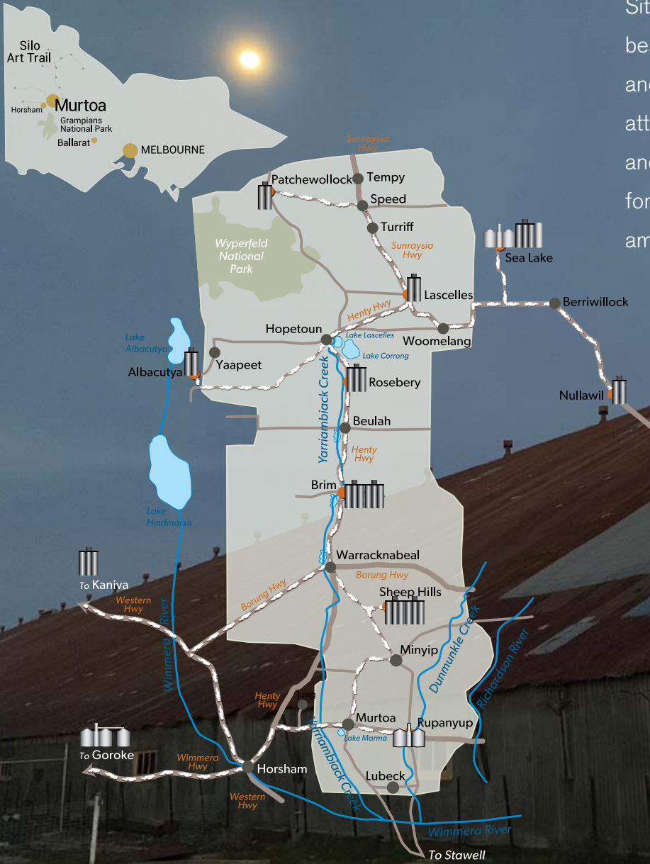
Murtoa Water Tower Museum

Situated in Regional Western Victoria beside the Yarriambiack Silo Art Trail and amongst other thriving tourism attractions, The Stick Shed is a unique and iconic building in Australia waiting for you to explore and experience its amazing interior.