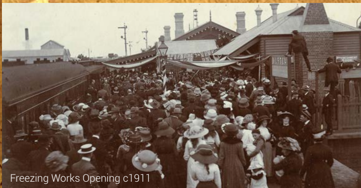
Freezing Works Opening c1911

Reflect on the Military history of the local area.