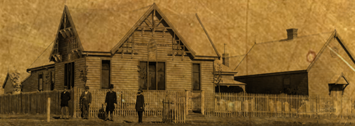
Established in Murtoa, 1890