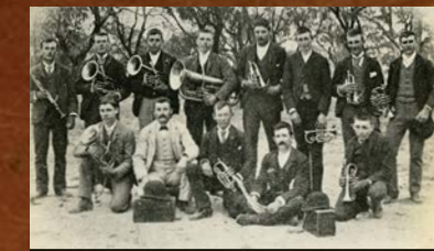
Coromby Brass Band, 1895

Explore the displays of German and Lutheran heritage and the longest ongoing Brass Band in Australia - the Coromby Brass Band .